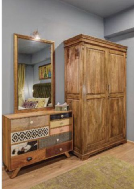
Weathered grey timber cladding with walls painted in Bondi blue channel the laid-back beachy vibe of the city. Everything about this room is understated and elegant.