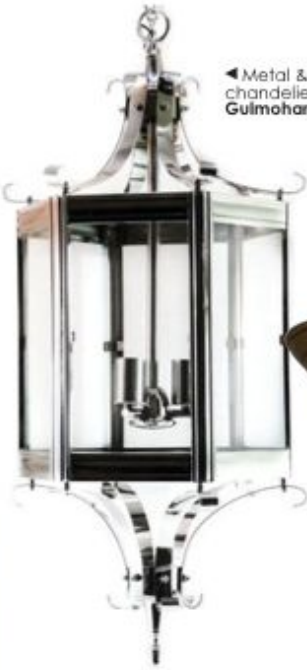
◀ Metal & glass chandelier, ₹27,900, Gulmoharlane