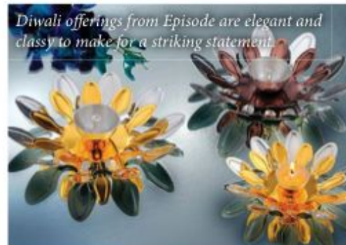
Diwali offerings from Episode are elegant and classy to make for a striking statement.