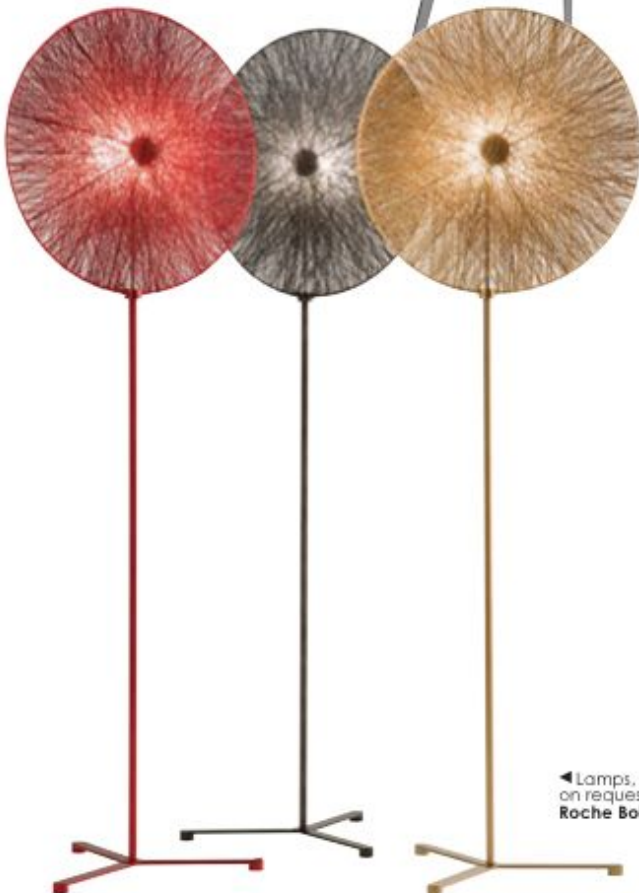
◀ Lamps, price on request, Roche Bobois