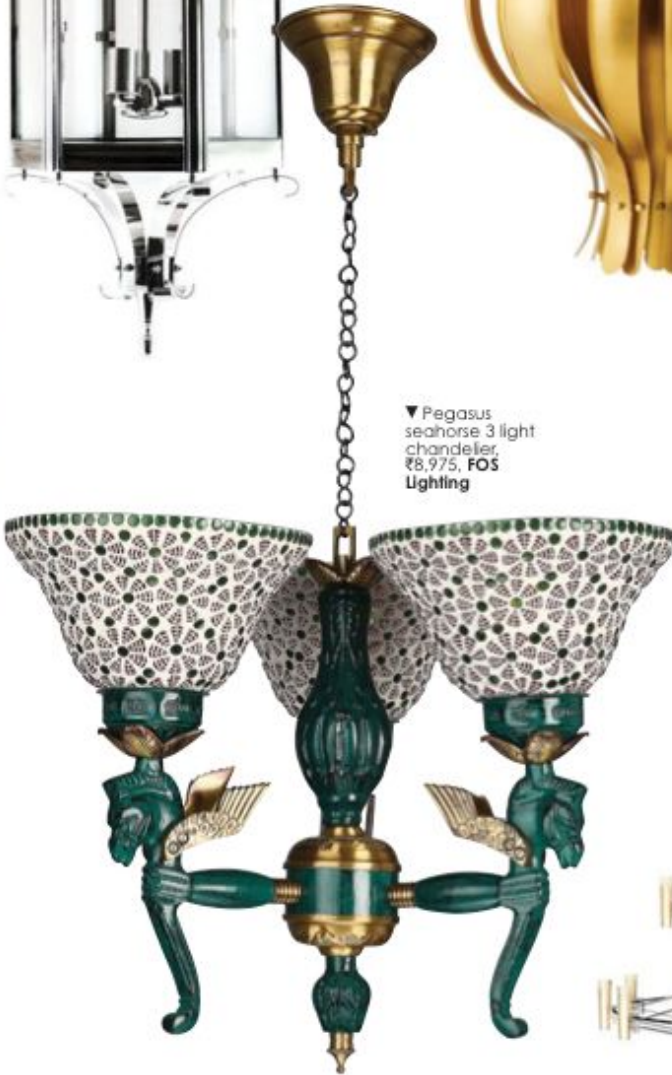
▼ Pegasus seahorse 3 light chandelier, ₹8,975, FOS Lighting