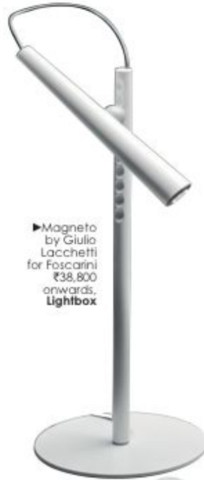
▶ Magneto by Giulio Lacchetti for Foscarini ₹38,800 onwards, Lightbox