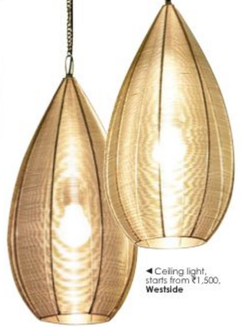
◀ Ceiling light, starts from ₹1,500, Westside