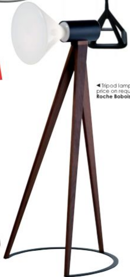
◀ Tripod lamp, price on request, Roche Bobois