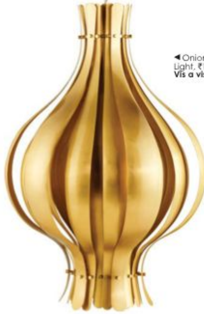
◀ Onion Pendant Light, ₹1,50,000, Vis a vis