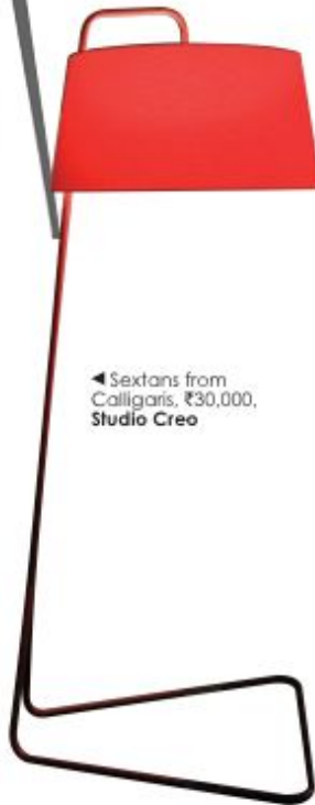
◀ Sextans from Calligaris, ₹30,000, Studio Creo