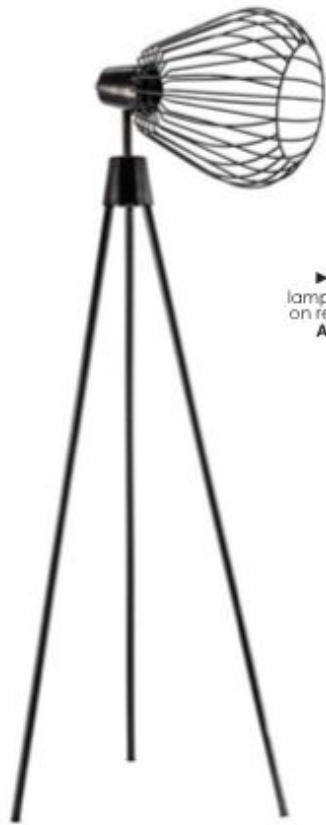
▶ Tripod lamp, price on request, Address Home