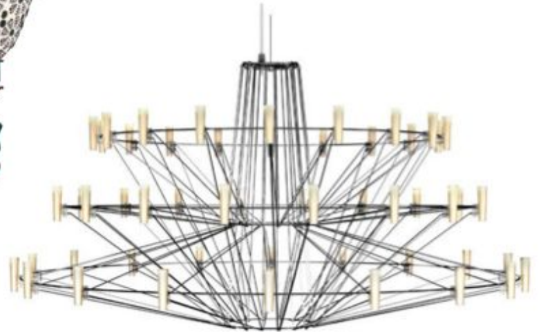
▼ Coppelia for Moooi, ₹2,40,000, Lightbox