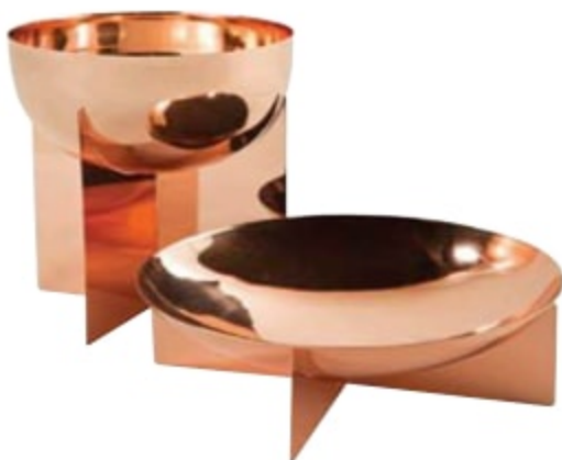
Graal, ₹ 58,725 (Big), ₹ 38,475 (Small) Roche Bobois