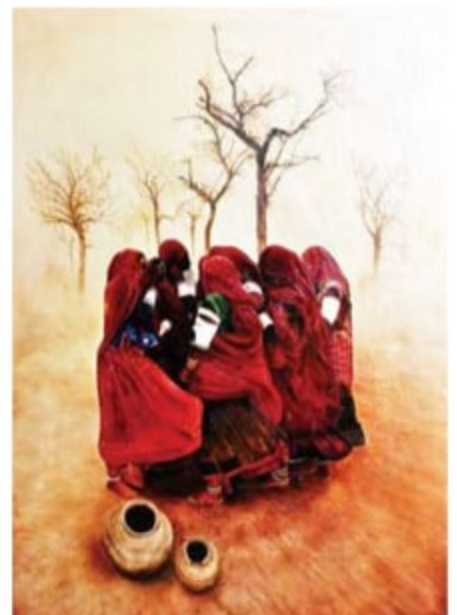
Woman Caught in a Dust Storm (Painting), ₹ 30,700 Huesnstrokes.com