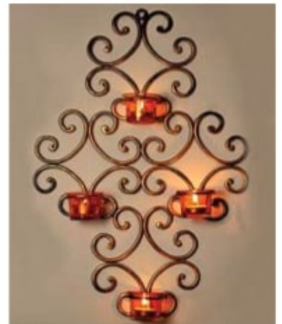
Wall Sconce With 4 Tea Lights Holder, ₹ 1,699 Fashionandyou.com