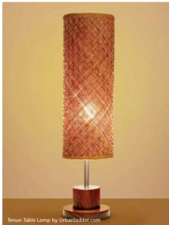
Tenun Table Lamp by Urbanladder.com