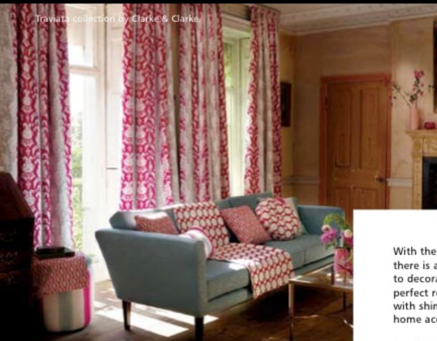
Traviata collection by Clarke & Clarke