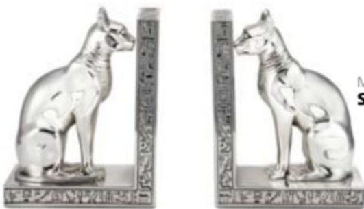
Milo Bookend, ₹ 20,050 Shaze