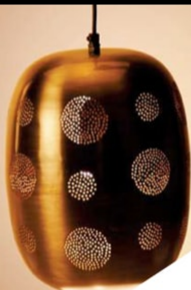
Kovana Pendant Lamp by Urbanladder.com