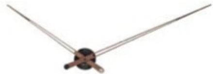
Metal Chopstick Style Clock, ₹ 35,000 Anemos