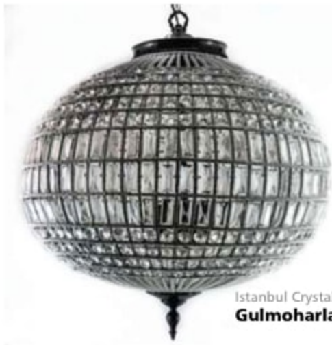
Istanbul Crystal Chandelier, ₹ 23,900 Gulmoharlane.com