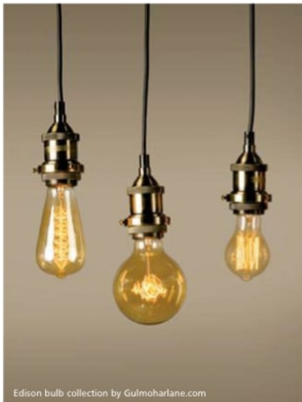
Edison bulb collection by Gulmoharlane.com