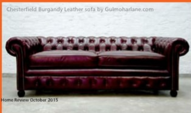
Chesterfield Burgandy Leather sofa by Gulmoharlane.com