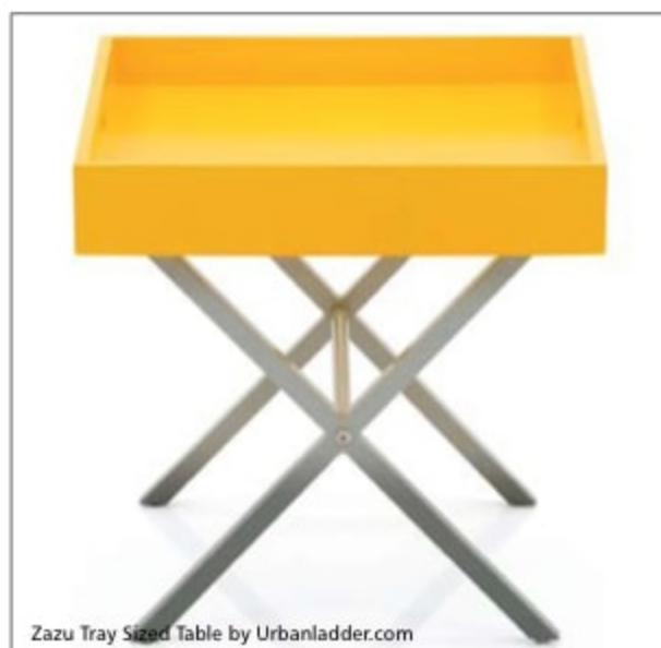
Zazu Tray Sized Table by Urbanladder.com

✉ www.urbanladder.com www.gulmoharlane.com