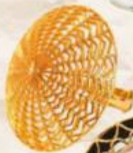
'CHEVRON' RING, ₹14,249, AND BLACK AND GOLD RING, ₹8,999, BY VAITANIKA, EXCLUSIVELY.COM