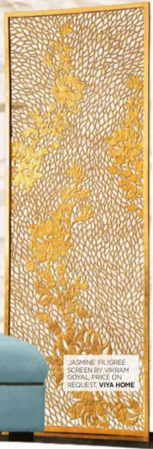
'JASMINE' FILIGREE SCREEN BY VIKRAM GOYAL, PRICE ON REQUEST, VIYA HOME