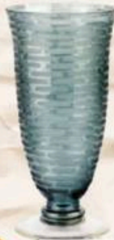
GLASS VASE, ₹2,760, CINNAMON