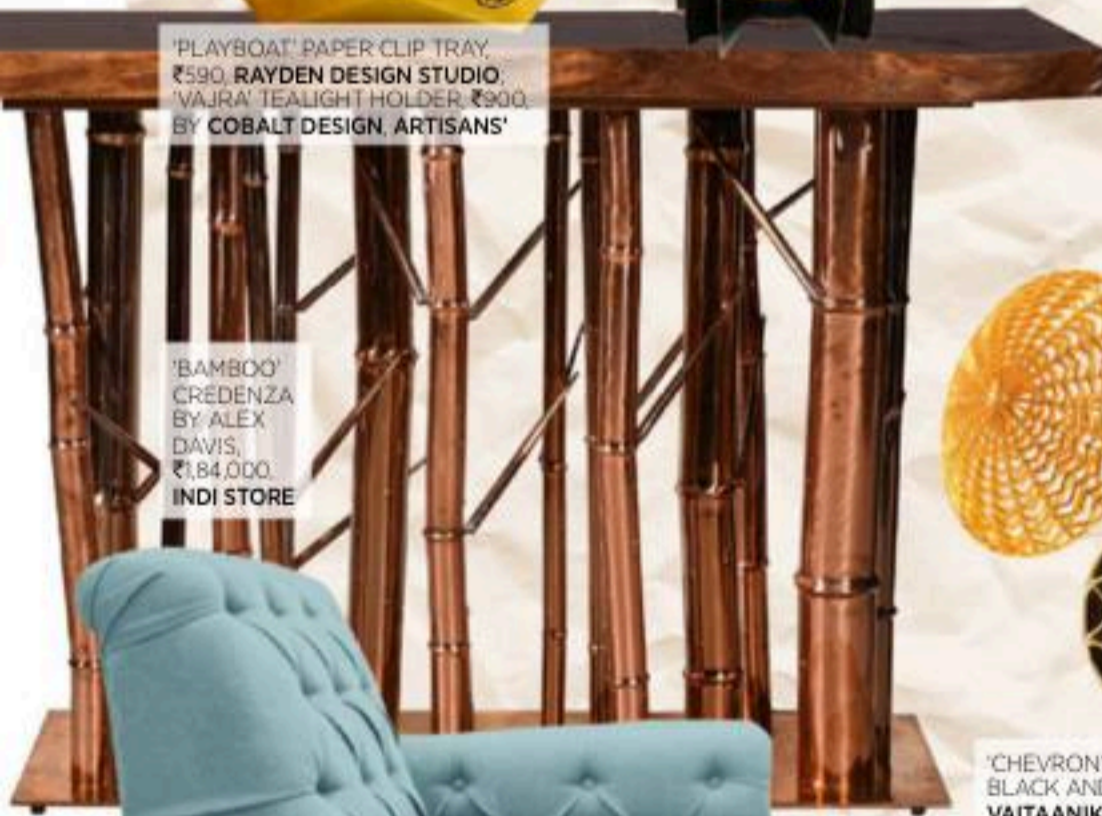
'BAMBOO' CREDENZA BY ALEX DAVIS, ₹1,84,000, INDI STORE