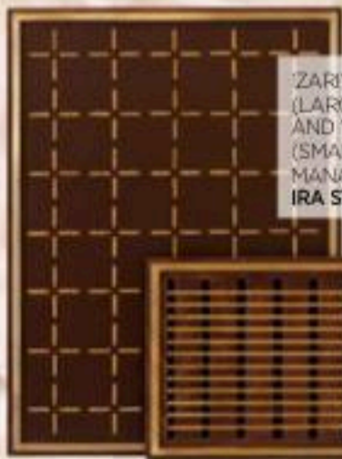
'ZARI' TRAY (LARGE), ₹7,600 AND 'PATTI' TRAY (SMALL), ₹2,800, BY MANASA PRITHVI, IRA STUDIO