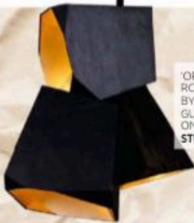
'ORIGAMI ROCK' LAMP BY GUNJAN GUPTA, PRICE ON REQUEST, STUDIO WRAP