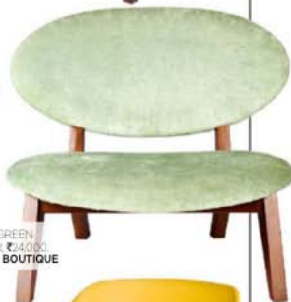
LOW GREEN CHAIR, ₹24,000. CANE BOUTIQUE