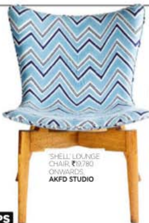
'SHELL' LOUNGE CHAIR, ₹19,780 ONWARDS. AKFD STUDIO