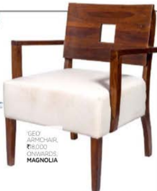
'GEO' ARMCHAIR, ₹18,000 ONWARDS. MAGNOLIA