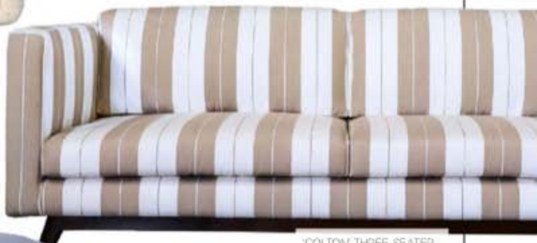
'COLTON' THREE-SEATER SOFA, ₹28,900 ONWARDS, GULMOHARLANE.COM