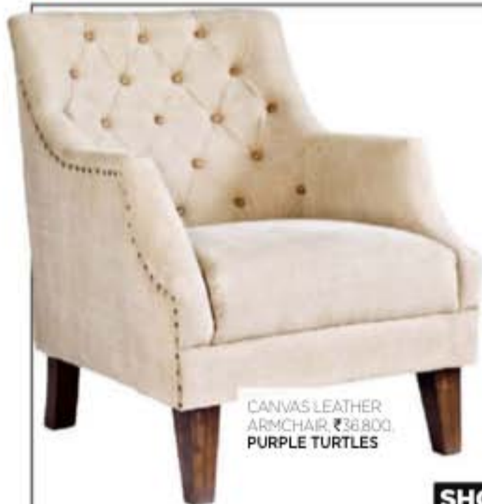
CANVAS LEATHER ARMCHAIR, ₹38,800. PURPLE TURTLES