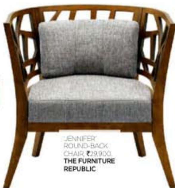
'JENNIFER' ROUND-BACK CHAIR, ₹29,900. THE FURNITURE REPUBLIC