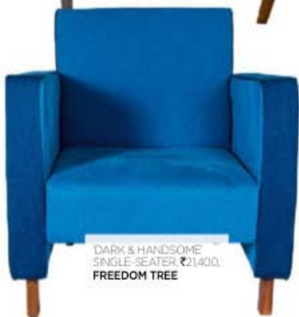
DARK & HANDSOME SINGLE-SEATER, ₹21,400. FREEDOM TREE