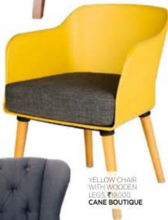
YELLOW CHAIR WITH WOODEN LEGS, ₹19,000. CANE BOUTIQUE