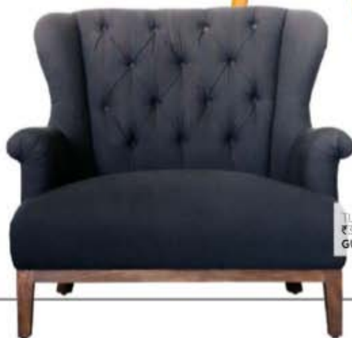
TUFTED LOVE SEAT, ₹35,500 ONWARDS. GULMOHARLANE.COM