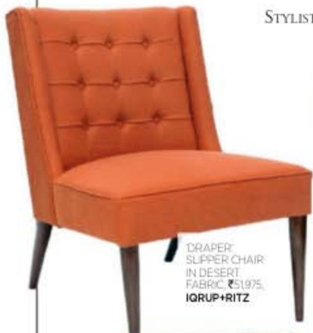
'DRAPER' SLIPPER CHAIR IN DESERT FABRIC, ₹51,975. IGRUP+RITZ